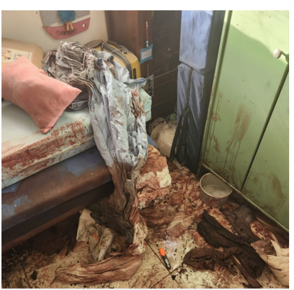
A child's blood-soaked room in Kibbutz Be'eri after the attack of October 7, 2023.

However, some principles are clear. Not only does proportionality not mean equivalence to the original attack, but the principle does not even relate to the original attack. Rather, it relates to the military objective of the party conducting the operation. This does not mean the original attack should be irrelevant – it often defines the military objective of the defender – but it is not the reference point against which proportionality of the response is to be measured.