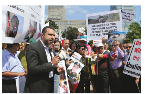
Majed El Shafie speaks at a protest advocating against the Muslim Brotherhood.

Armenia, Pakistan, Afghanistan, Iraq, Cuba, Israel, India, and Bangladesh, where he has met face-to-face with top government officials to open dialogue about these issues and often to confront officials with evidence of human rights abuses in their countries and the failure of their governments to address these issues. Some of his efforts have been documented in an award-winning feature film, Freedom Fighter.