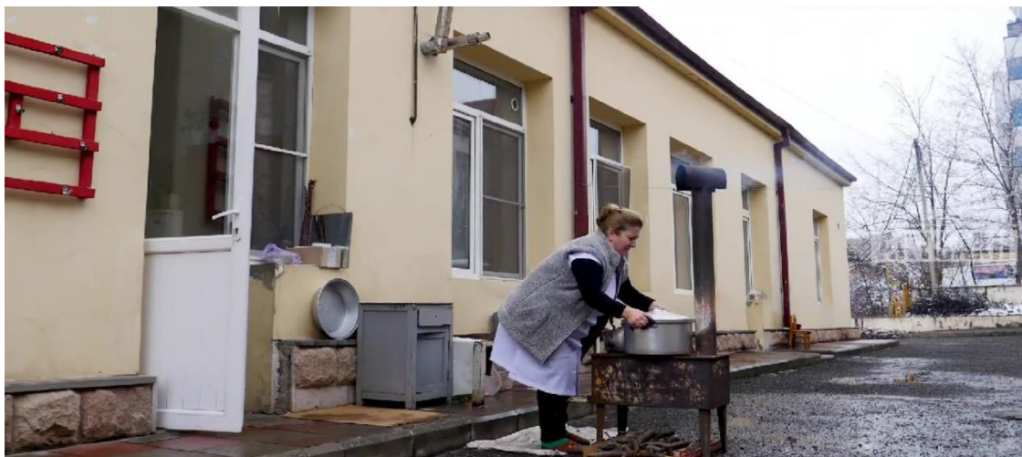
Image 6. The process of food preparation in one of the kindergartens of Stepanakert

100% of higher education institutions are heated by gas. In the current situation, some universities have passed to distance learning.