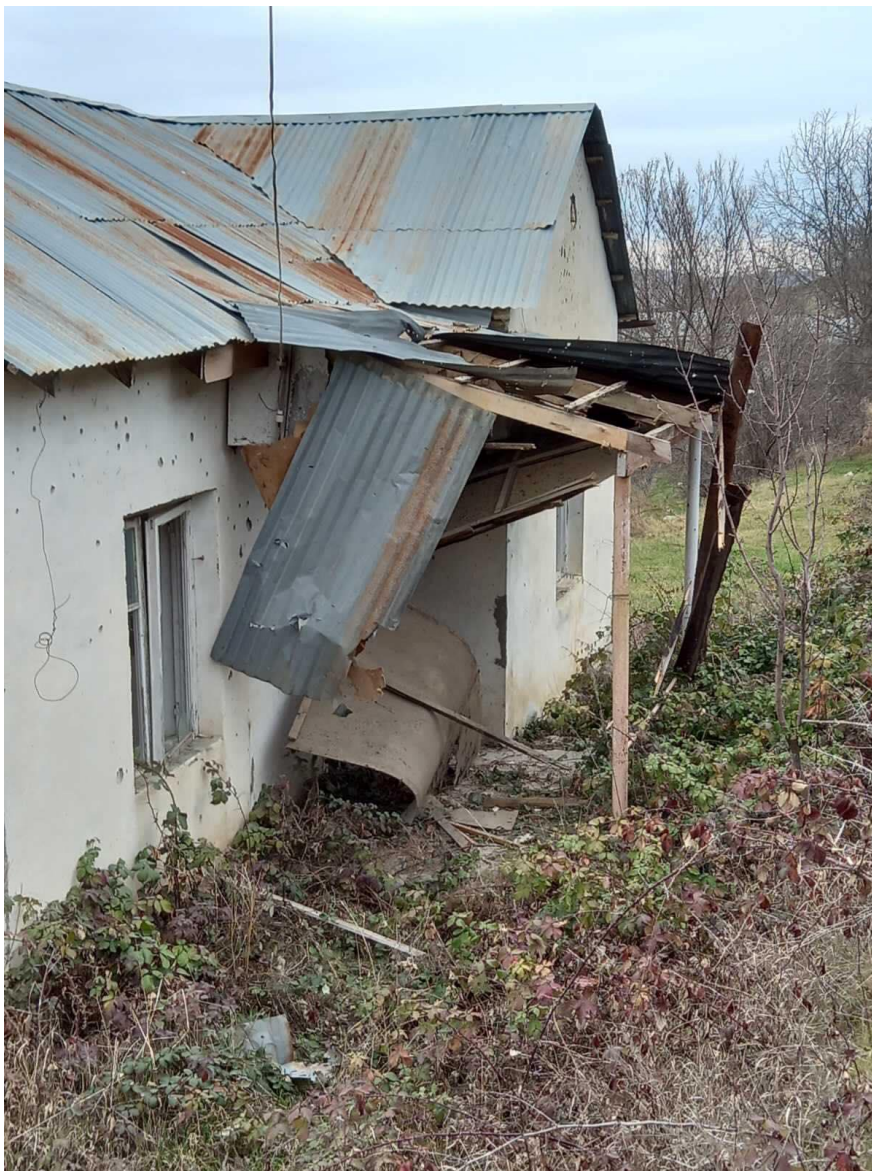
Image 2 . Damaged community building in Parukh village