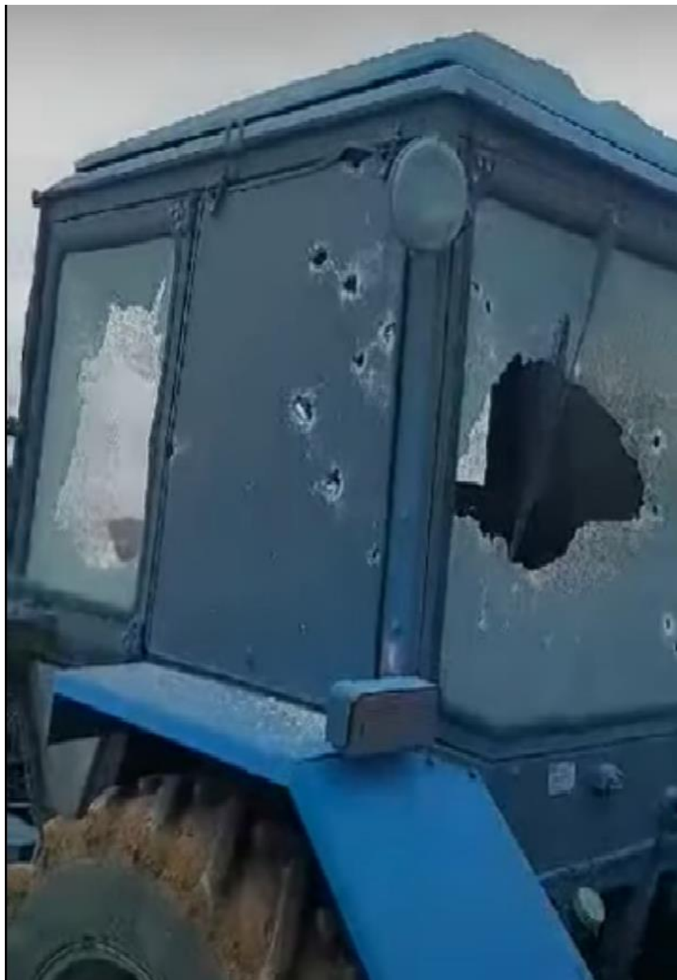
Image 3 . Damaged tractor in Nakhichejanik village