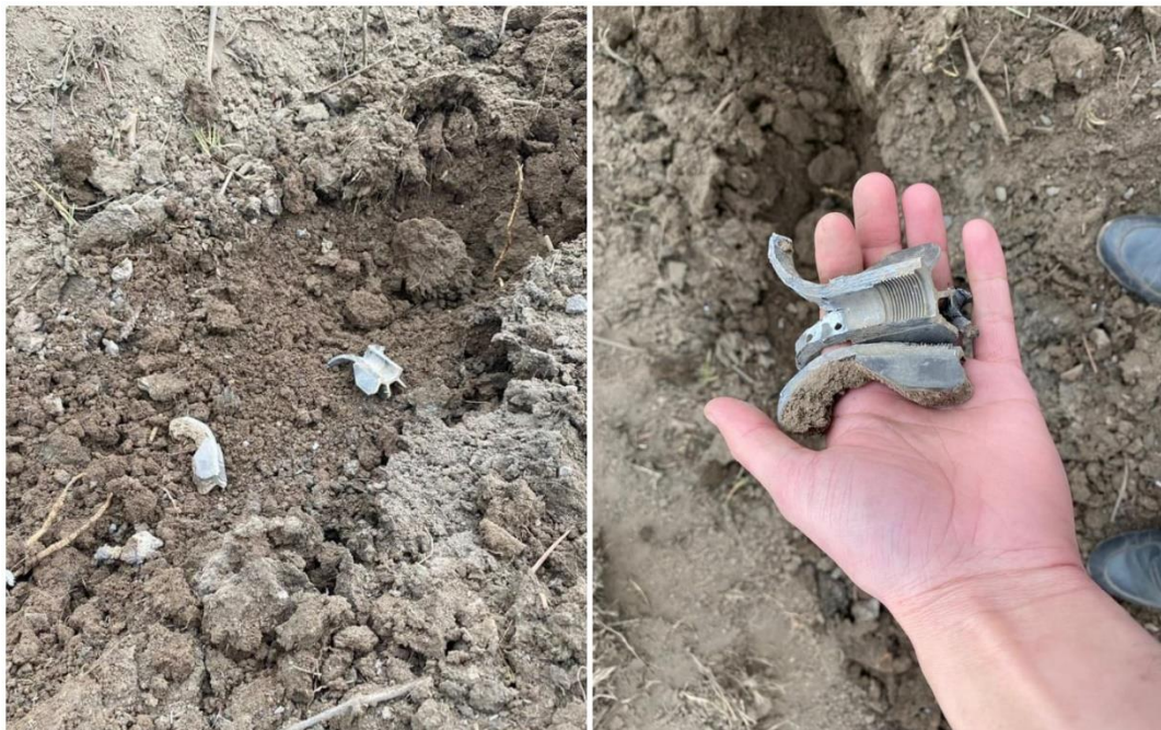
Image 4 . Ammunition remains in a vineyard in Khrmort community