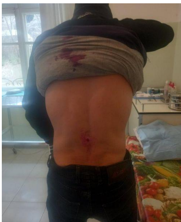
Image 5 . Injured civilian in Khrmort