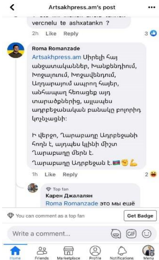
Image 8. Azerbaijani user comment

Posts and comments with the same content are also spread by Azerbaijani Facebook users. Image 8 shows the comment of an Azeri user, urging Armenians to leave immediately, otherwise the Azerbaijani army will destroy everyone.